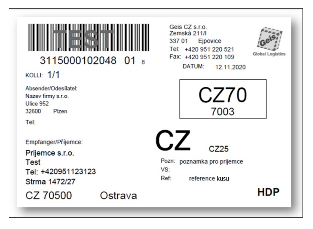
Figure 7: Preview of label with service HDP (eventual HDS).