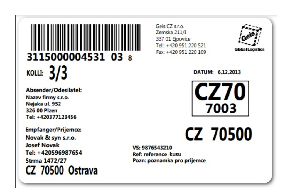
Figure 6: Previews of labels – shipment with three pieces.