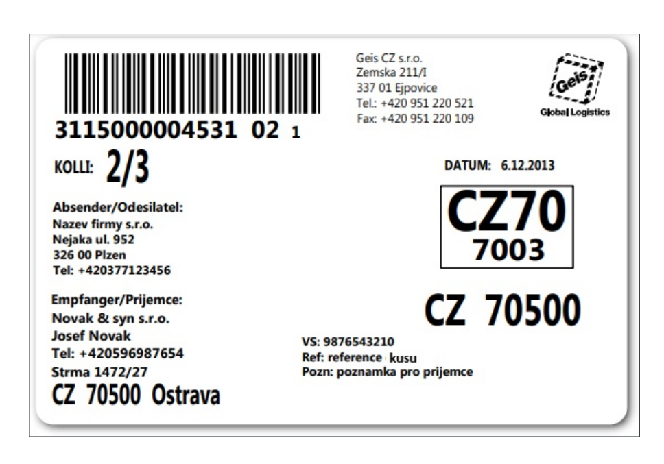
Figure 5: Previews of labels – shipment with three pieces.