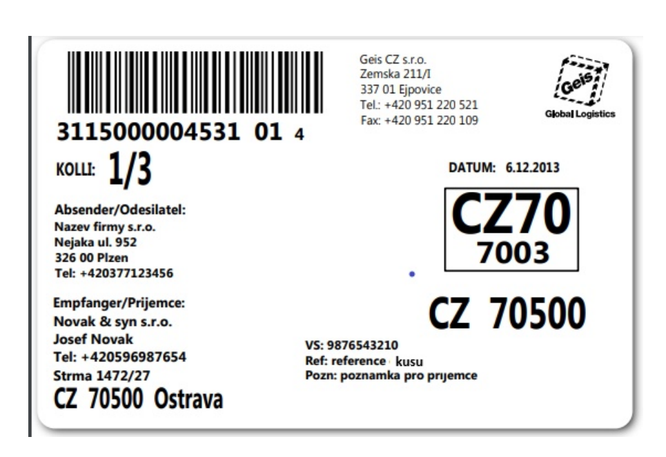
Figure 4: Previews of labels – shipment with three pieces.