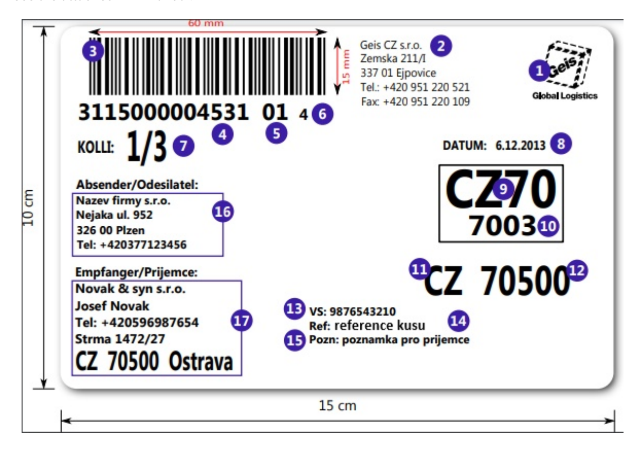
Figure 3: Label layout

The figure 3 shows the layout of the content on the label and in the list behind it, there are explanatory notes provided. The template defined by us is used for the printing of text without diacritics, therefore enter text chains without any diacritics. When defining an own template, the diacritics support is possible, see the attached EPL manual.